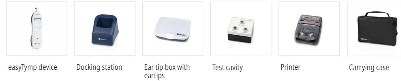
easyTymp device Docking station Ear tip box with eartips Test cavity Printer Carrying case